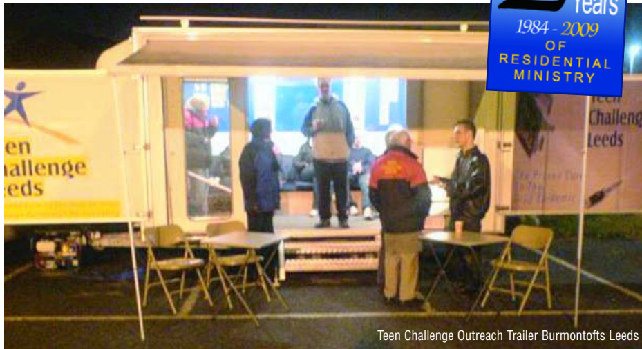
Teen Challenge Outreach Trailer Burmantofts Leeds

Teen challenge Leeds (pictured) is established in 5 communities around Leeds and is taking 'church' to the streets. This is just one of the permanent evangelistic Teen Challenge centres which have been planted during the last twenty-five years – these have hundreds of trained workers who engage with troubled and hurting young people each week.